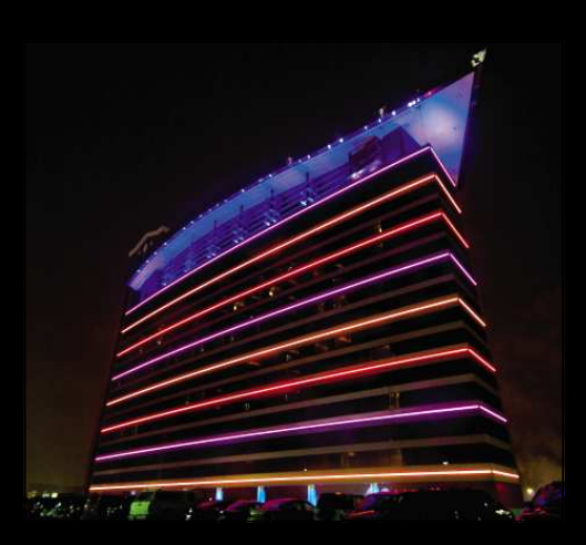
MotorCity Casino Hotel