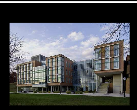
University of Michigan