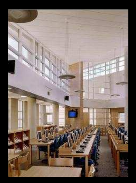
Whitmore Lake High School