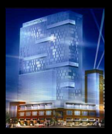
Greek Town Casino

A NATIONAL CONSTRUCTION ENTERPRISES COMPANY